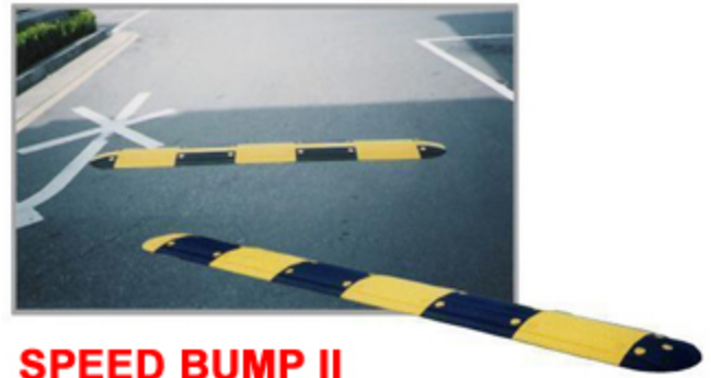
SPEED BUMP II (Model No: SB-02)