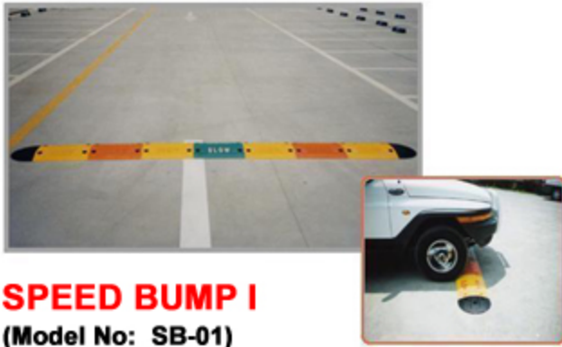
SPEED BUMP I (Model No: SB-01)

This traffic safety product helps reduce speed with high visibility. It has outstanding durability as well as exceptional weather resistance. It is highly mobile (i.e. can be installed and removed easily) and requires no maintenance.