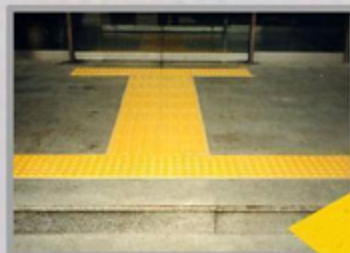
BRAILLE TILE (Model No: BT-01 & BT-02)

※Installation method: both-sided adhesion